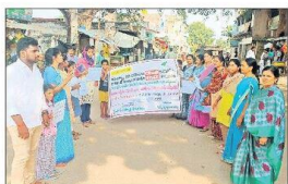
అవగాహన కల్పిస్తున్న అధికారులు