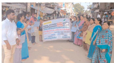
బాల్య వివాహాల నిర్మూలనపై